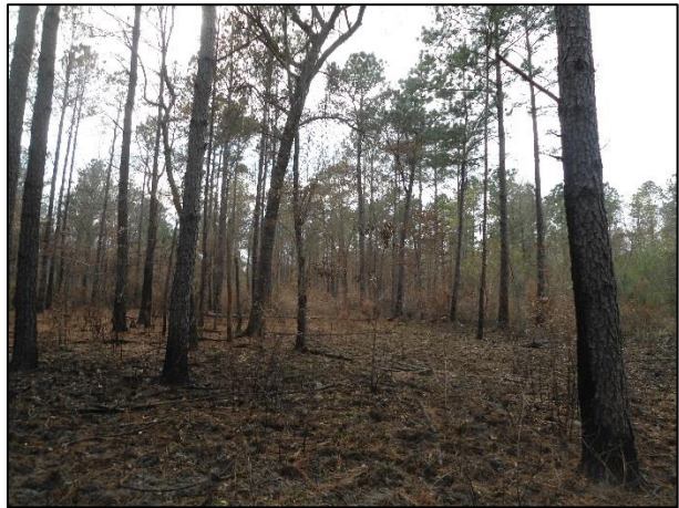
Mixed Pine-Hardwood Stand, Angelina County, 144 acres