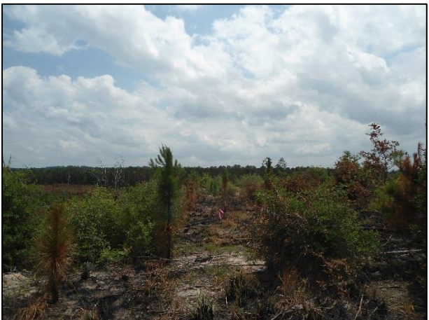
Longleaf pine, Jasper County, 203 acres