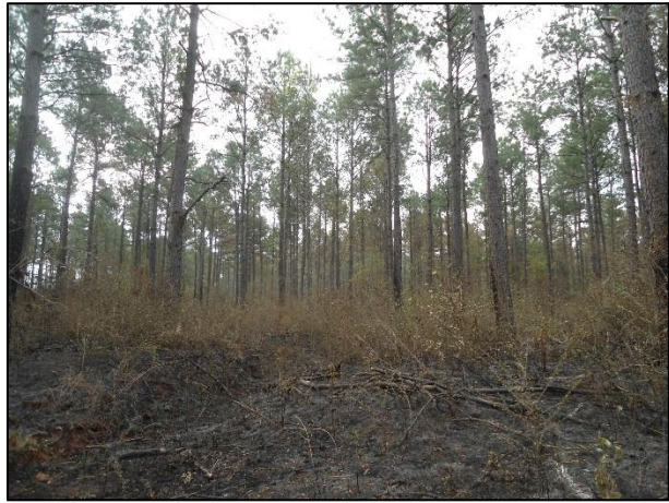
Mid-rotation loblolly pine plantation, San Augustine County, 270 acres